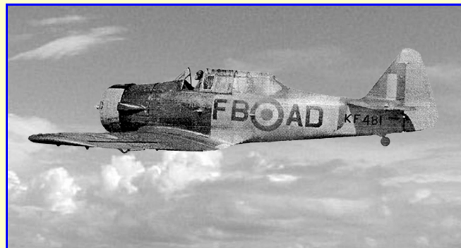
One of the Harvards flown by the author at the RAF base at No. 7 FTS, Cottesmore, England